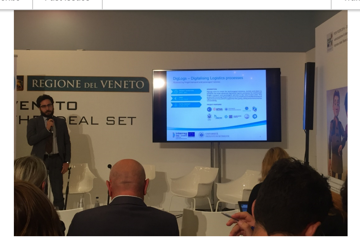
The DigLogs presentation at Venice International Film Festival 2019.